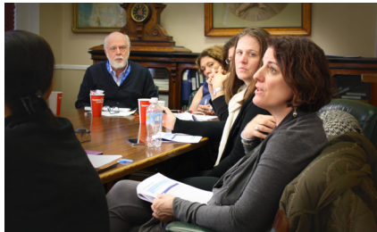
On Thursday, March 12th, Transitional Work Groups discussed risk and mitigation strategies for BPHC's Implementation Plan.

Transitional Work Groups (TWG's) met for the first time on Thursday, March 12th to provide valuable feedback to our Implementation Plan. The meeting focused on identifying risks in our project plan and strategies for mitigating these risks.